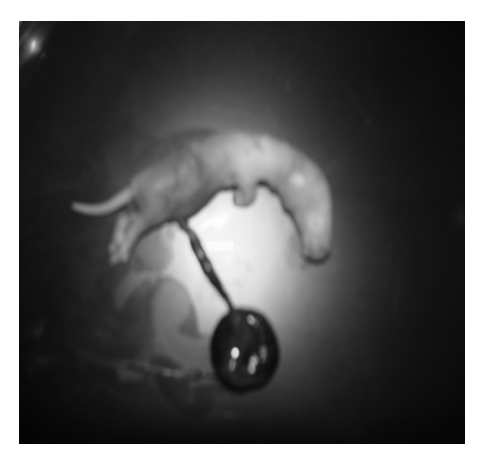
Figure 3: Malformed embryo of BPA exposed female rat. Embryo with abnormal snout morphology

to 50 ng/mL during days 30 to 90 of gestation resulted in low birth weight in offspring (Savabieasfahani et al. , 2006).