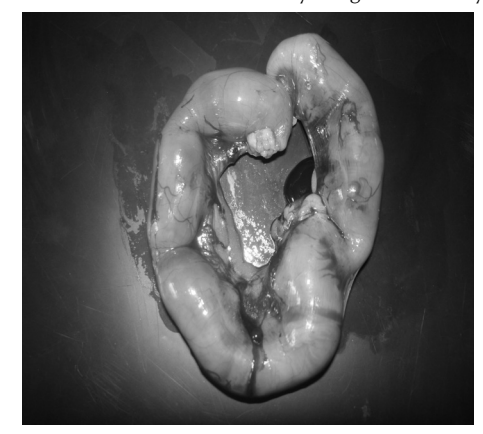
Figure 1: Gravid uterus of control female rat.(Uterus having normal embryos)

body weight gain during initial period of gestation and absolute body weight gain can be attributed to the general metabolism of the body which is a steroid sensitive parameter (Akingbemi et al., 2004). Bisphenol A stimulated growth especially in female rats due to its estrogenic properties. Some of the earlier reports suggested that developmental exposure to BPA and other environmental chemicals with endocrine - disrupting effects is associated with obesity in mice after they reach puberty and throughout maturity (Miyawaki et al., 2007). How prenatal exposure to BPA may exert lasting effects on body weight remains to be determined. Most recently Bisphenol A was shown to increase gene expression of adipogenic transcription factors in 3T3-L1 preadipocytes (Phrakonkham et al., 2008). If similar actions of BPA occur in vivo, they would be expected to contribute to increased adiposity and increased body weight. The gravid uterine weight was significantly (p < 0.05) decreased in treated groups (Fig. 2A and 2B) compared to control (Fig. 1) due to reduced number of viable off springs and increased resorptions after BPA exposure. These results indicate that BPA can readily cross blood placental barrier