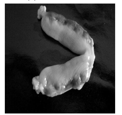
Figure 2B: Gravid uterus of BPA exposed female rat. Resorptions were observed in uterus and no normal embryos were seen

(Markey et al. , 2010) and that maternal BPA exposure transferred to the fetus can cause resorptions, reduced birth outcomes, developmental abnormalities and other adverse health effects in the offspring (Somm et al. , 2009) suggesting embryo toxicity and foetotoxicity. Observations in pregnant Fischer rats have reported that BPA, administered in a single oral dose, is able to rapidly traverse the placenta and distribute